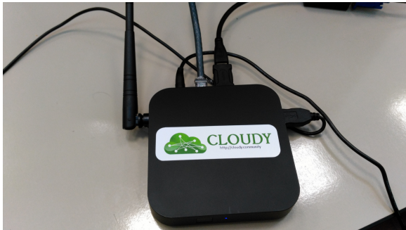
Fig. 2. Example of a community cloud node.

Figure 2 shows a typical node which has been recently deployed in the Guifi community cloud. The device from Minix 5 comes with a low energy consuming Intel Z3735F (64-bit) processor, 2 GB of RAM and 32 GB of internal storage. Over the USB port, additional storage capacity can be added by the user.